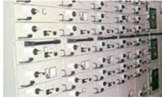
LV Drawout Switchboard