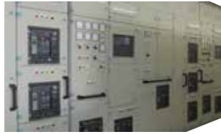
LV Main Switchboard