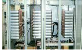
LV Harmonic Filter